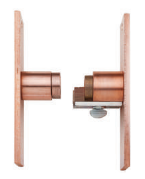
Small Parts Adapters