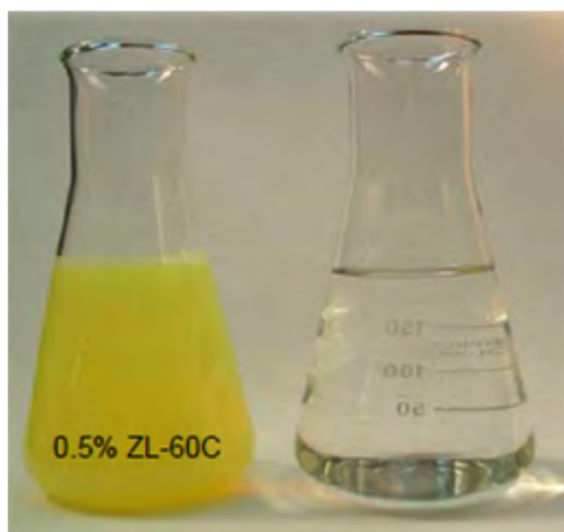
Penetrant rinsewater before and after treatment.